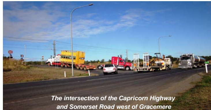
The intersection of the Capricorn Highway and Somerset Road west of Gracemere

Construction of the overpass bridge and access road is expected to commence in early 2012 following the announcement of $50 million funding in the 2011 – 12 state budget. With an anticipated 12 month construction timeframe, weather permitting, the Gracemere Industrial Access is expected to open to traffic in early 2013.